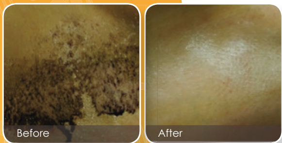
Post 6 Mo 1 Tx